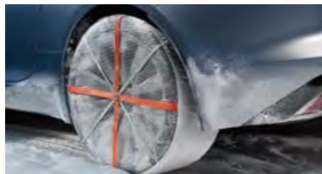
Snow Sock Winter Traction Aid An innovative lightweight textile snow and ice traction aid for use on roads in winter conditions. Easy and quick to attach, packs down for easy stowage. Fitment to all four wheels is recommended.