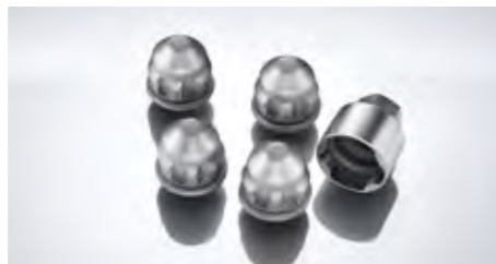
Locking Wheel Nuts Protect your wheels with custom designed high-security locking wheel nuts.