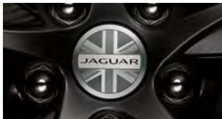
Wheel Centre Badge - Union Jack A distinctive monochrome centre badge featuring the Jaguar logo with a Union Jack design providing a British twist.