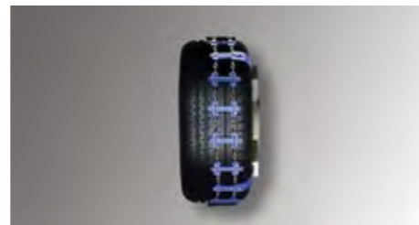
Snow Traction System Improved mobility in snow, mud and icy driving conditions with this high-grip snow chain traction system. Fits the rear wheels only.