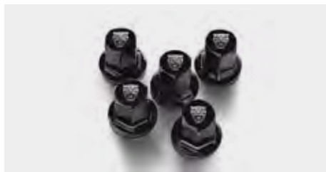
Jaguar Logo Wheel Nuts - Black Enhance the look of your XJ's wheels with Jaguar branded Black wheel nuts.