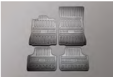
Rubber Mats Hard wearing Jaguar branded rubber mats provide added protection for your vehicle's carpets.