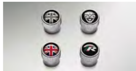
Styled Valve Caps Add the finishing touch to your XJ's wheels with a range of unique custom valve caps.