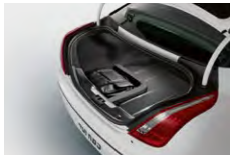
Flexible Luggage Retainer Provides a neat stowage solution to help secure luggage or other items within the luggage compartment area.