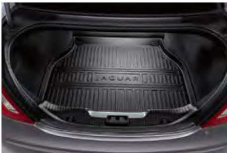
Luggage Compartment Rubber Liner This premium liner tailored specifically for your vehicle will protect the luggage compartment floor with a raised lip around the edges to protect the side walls. Light and durable, it is easily removable for cleaning.