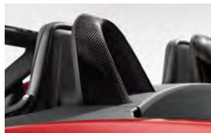
Roll Hoops - Silver Weave Carbon Fibre