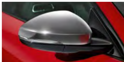
Mirror Covers – Chrome Chrome mirror covers accentuate the stylish design of the exterior mirrors. Left and right side options available.