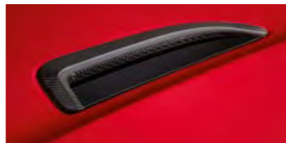
Bonnet Louvres – Carbon Fibre High grade Carbon Fibre bonnet louvres featuring a 2x2 twill weave and a High Gloss lacquered finish. Provides a performance-inspired styling enhancement coupled with weight benefits associated with Carbon Fibre.