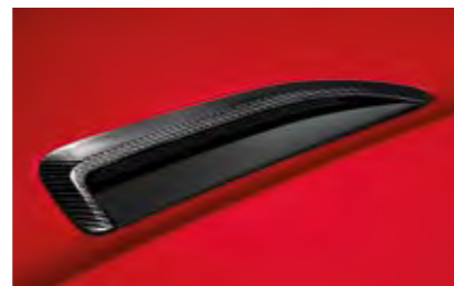
Bonnet Louvres - Silver Weave Carbon Fibre