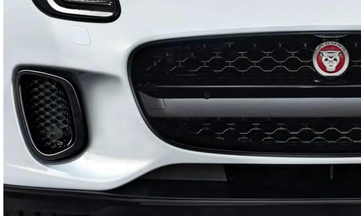
Grille – Gloss Black Provides a High Gloss Black finish to the grille surround and bumper beam accentuating the F-TYPE's dynamic appearance.