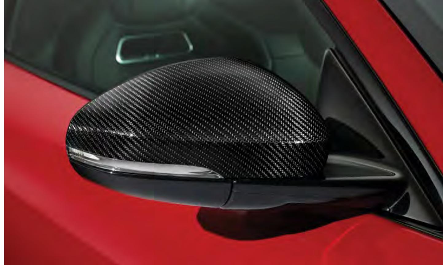
Mirror Covers - Silver Weave Carbon Fibre