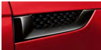
Side Power Vents – Gloss Black Jaguar branded Gloss Black side power vents provide a dynamic exterior styling enhancement.