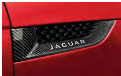
Side Power Vents - Silver Weave Carbon Fibre

Designed, engineered and tested by Jaguar, Silver Weave Carbon Fibre accessories provide the ultimate performance-inspired styling enhancement. The range includes: Silver Weave Carbon Fibre mirror covers, side power vents, bonnet louvres and roll hoops, featuring a 2x2 twill weave with an eye-catching aluminium thread and a High Gloss lacquered finish.