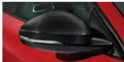
Mirror Covers – Carbon Fibre High grade Carbon Fibre mirror covers provide a performance-inspired styling upgrade.