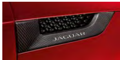
Side Power Vents – Carbon Fibre High grade Carbon Fibre side power vents provide a performance-inspired styling upgrade.